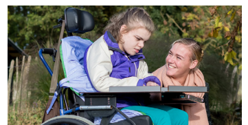
Spinal Injury Care

To find out more about any of our services, visit www.advantagehealthcare.com or call us on 0800 694 45 55. We provide services to clients funded by local authorities, clinical commissioning groups, self-funded or personal health budgets. In all cases a thorough case assessment will be undertaken to ensure that the service provided meets the medical needs of the client and they can make personalised requests.